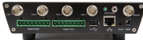
Figure 2: Back view of appliance

For more information, contact your authorized CheckVideo partner: