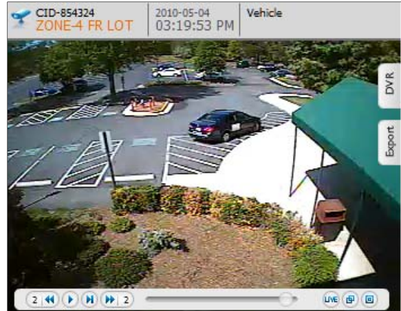
Figure 1: Video alarm clip as presented to operator